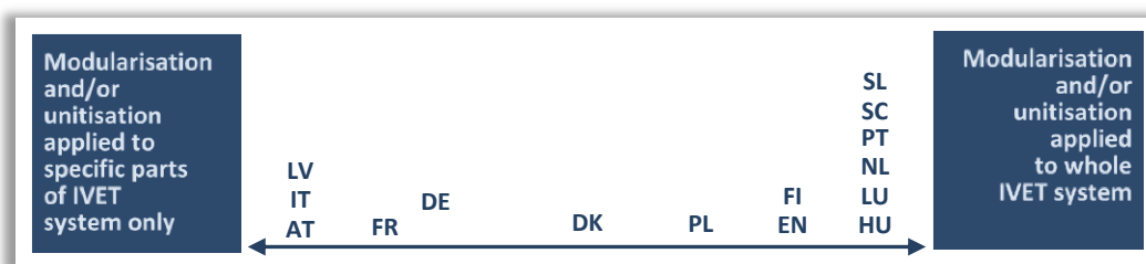
Figure 1. The extent of modularisation and unitisation across all 15 countries

Innovation processes in an education and training system can be more or less 'radical' in breaking with existing procedures and standards. Some countries have applied modularisation and unitisation to all aspects of initial vocational education and training (IVET) provision, while others have taken a more cautious 'evolutionary' approach, where only specific qualifications or aspects of qualifications in the IVET system are modular or unitised. It is also possible to envisage a third 'parallel' approach that enables traditional structures to exist alongside new arrangements (see also Pilz, 1999, pp. 240-288). Figure 1 illustrates where the 15 countries might be placed in terms of the extent to which their qualifications have adopted modular or unitised approaches.